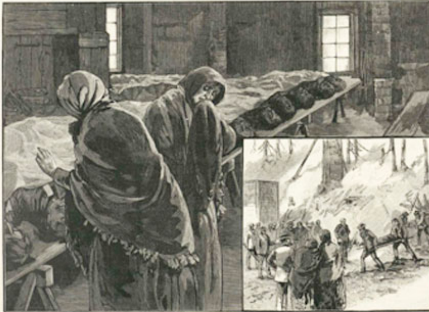
WOMEN AND MACHINES.