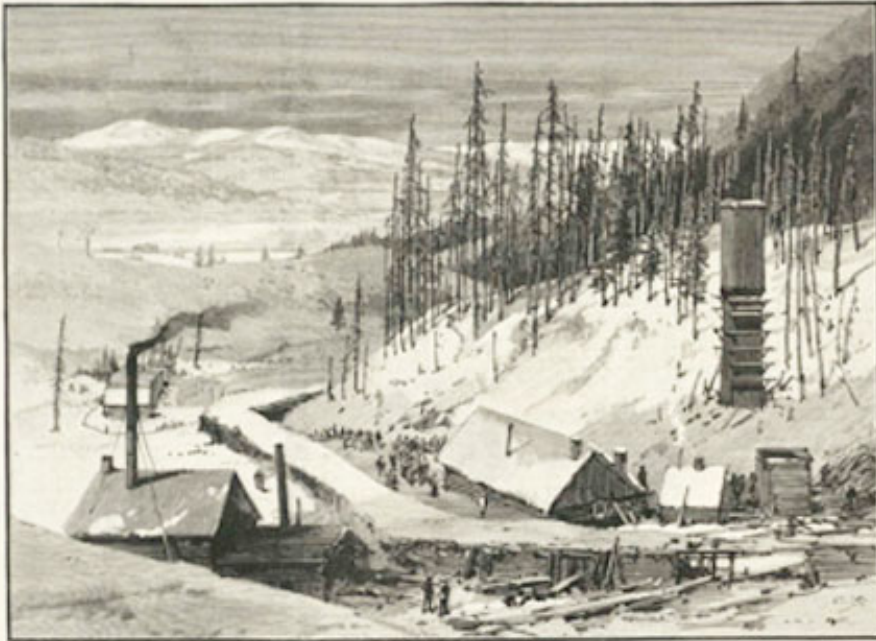
THE WIND OF THE SNOWS.