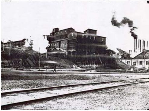
Cokedale Historic District