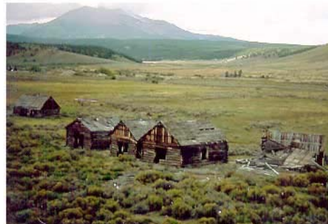
Derry Mining Site Camp

Although a large rambling, log and wood-frame building on the approximately 8½-acre site dates from earlier ranching operations, the property primarily reflects its association with the mining activities occurring there from 1906 to 1923. Ditches, ponds, and tailings piles continue to dot the landscape. The circa 1916 log cabins were constructed to house workers hired in conjunction with the operation of the Derry Dredge. This large "mountain boat" was assembled at the site in 1915 to operate along Corske Creek. About 1923, it was relocated to Box Creek. The dredge was dismantled in 1926 and subsequently shipped to South America.