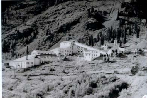
Silverton Historic District