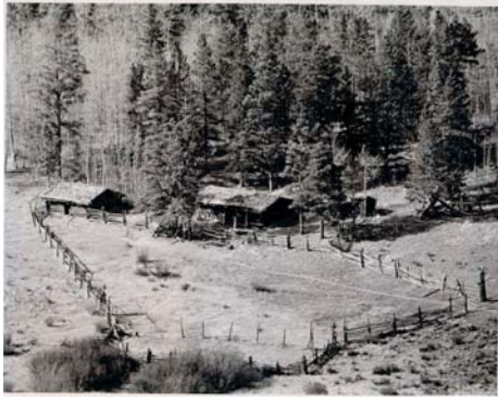
Littlejohn Mine Complex