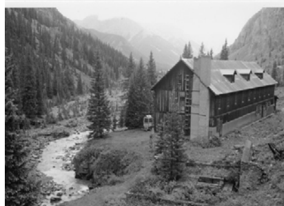
Martin Mining Complex

The Martin Mining Complex is a 42.6-acre parcel straddling the Animas River. The only standing building is a 2½-story boardinghouse with full basement situated near a shallow rocky ledge above a steep river gorge in the narrow upper Animas River Valley. The Martin Boardinghouse is 106-feet long with an additional 8 feet added on to the south end for an entry porch. The building is a simple rectangular-linear floor plan constructed of rough, native stone masonry laid in an irregular fashion.