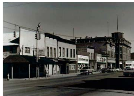
Leadville Historic District

The district encompasses a scattered collection of architecturally distinctive and historically important masonry buildings supported by numerous residential and commercial buildings that contribute to the overall appearance associated with late 19 th -century western mining towns. The Leadville mining district ranks as one of the country's richest mineral regions. The first gold mining boom occurred in 1860, bringing approximately 10,000 miners to the area. A second boom began in 1878 with the discovery of extensive silver deposits. By 1880, the population was estimated to be between 25,000 and 40,000. The fortunes of Leadville's best known silver king, H.A.W. Tabor, crashed along with silver prices in 1893.