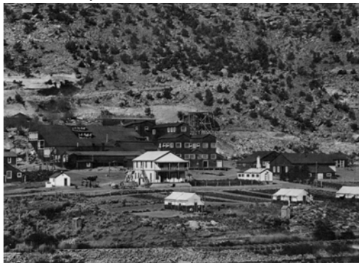
Joe Jr. Mill and Camp

Uravan helped give birth to the nuclear age when in 1912 the Joe Jr. Mill began processing carnotite ore into its base elements of radium, vanadium, and uranium. The remaining camp boarding house, store, and recreation hall help convey the important history of the people behind the industry.