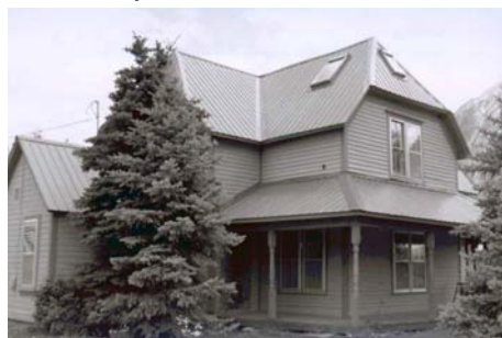
CF&I Superintendent's House

Originally located on Big Mine Hill, this large wood-frame dwelling served as the residence for the superintendent of Colorado Fuel and Iron Company's mining and coke oven operations in the Crested Butte area from 1883 until 1952. Moved to its present location in 1971, its design is representative of CF&I superintendent's housing in company towns throughout Colorado. Built by the company, they were the most substantial and architecturally sophisticated residences in the community.