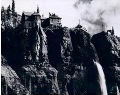
Smuggler-Union Hydroelectric Power Plant/Bridal Veil Powerhouse

Opened in 1907, the power plant is associated with the development of the Smuggler-Union Mining Company, one of Colorado's most important producers during the late 19 th and early 20 th centuries.