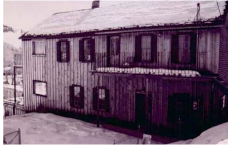
Rio Grande Hotel

The Rio Grande Hotel was constructed circa 1892 to relieve the extreme housing shortage resulting from the area's silver mining boom. The hotel was one of only a few wood structures to survive the town's devastating 1892 fire.