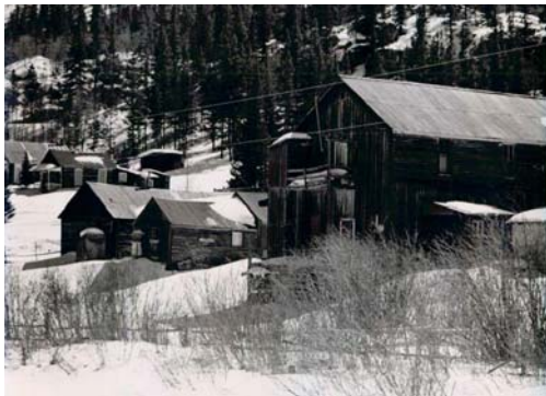
St. Elmo's Historic District / Forest City

St. Elmo owes its existence to the development of silver mining, which began in the Chalk Creek area in the 1870s. Originally platted as Forest City, its brief era of prosperity occurred during the 1880s with the coming of the Denver, South Park & Pacific and the Denver & Rio Grande railroads. The district consists of a group of primarily wood-frame commercial buildings and several clusters of residences dating from the 1880s and 1890s. The small vernacular buildings are representative of the type of construction found in early mining camps. The district is flanked by groves of pine and aspen growing on the mountain slopes rising sharply above the townsite.