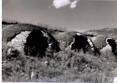
Redstone Coke Oven Historic District

The district is important for its association with the development of the coal mining and processing industry in Colorado. The Colorado Fuel and Iron Company constructed the ovens in 1899, during a period of expansion in the processing of coking coal brought about by the increased demand from the region's smelting industry. The Redstone ovens are also an important engineering resource, representing a type of industrial structure no longer in use and rapidly disappearing from the West.