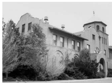
Minnequa Steel Works Office Building & Dispensary