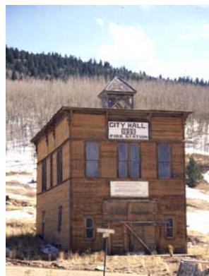
Goldfield City Hall & Fire Station

The community erected the simple two-story wood-frame building in 1899. By 1900, Goldfield was the third largest town in the booming Cripple Creek mining district. The building served as a city hall and fire station until 1940. It is the only remaining public building in what is now virtually a ghost town.