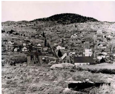
Central City – Black Hawk Historic District

Were it not for the discovery of gold in 1859, there is hardly a more unlikely location for the establishment of a "boomtown" than the rugged and inhospitable terrain of the surrounding mountainsides. From a humble collection of mining camps, hard work brought good fortune and led to the construction of substantial brick and stone buildings. Most of the surviving buildings are vernacular in their design, although many include Italianate detailing.