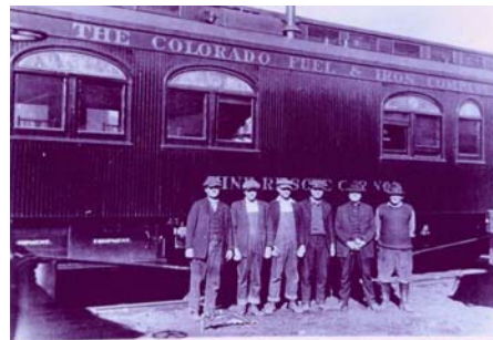
Mine Rescue Car No.1

Built in 1882 as a Wagner Palace Sleeping Car equipped with 12 upper berths and a drawing room, the Pullman Company rebuilt the car in 1906. The U.S. Government sold the car to CF&I. The company renovated and re-equipped the car for use at mine disasters before putting into service August 1923.