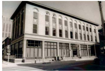
General Electric Building

The Denver Rock Drill and Machinery Company constructed the circa 1906 three-story brick building. The company supplied rock drills and other mining and milling machinery to enterprises across the Rocky Mountain region. General Electric later used the building as its primary distribution center for electrical supplies. The building is typical of combination office and warehouse structures built in lower downtown at the beginning of the 20 th century.