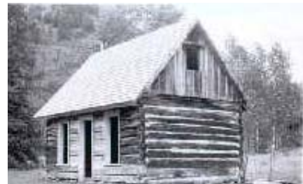
Frank Silence Cabin

The cabin is the sole surviving property within the former San Juan Mountain mining town of Capitol City.