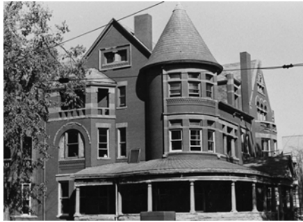
Sheedy Mansion – Grant Street Mansion

through his management of the Denver Dry Goods department store and his positions in the city's banking, mining and smelting enterprises.