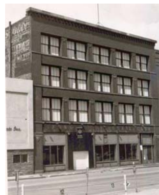
Hendrie & Bolthoff Warehouse