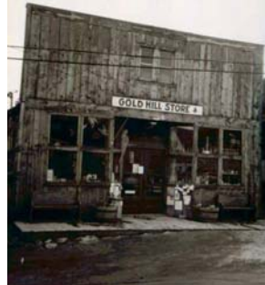
Gold Hill Historic District

Organized in 1859, Gold Hill was one of Colorado's earliest mining camps and remains an excellent example of the pattern of settlement and community development within the 19 th -century metal mining communities of Boulder County. Several examples of Pioneer Log construction remain intact. After 1900, few precious metal ores were recovered in Gold Hill, and the local economy shifted toward tourism during the first decades of the 20 th century.