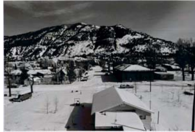
Lake City Historic District

Established in 1875 as a supply center for the heavy mining activity in the area, people found their way to Lake City via the Saguache-San Juan Toll Road built by Enos Hotchkiss, one of the town founders. A major fire in 1879 destroyed much of the downtown area. Many of the rebuilt buildings of brick and stone remain intact. An economic depression hit Lake City in 1884, and times were hard until the arrival of the railroad in 1889. Subsequently, trade flourished until the silver crash of 1893.