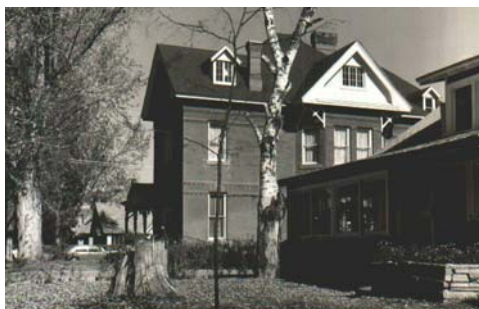
East Third Avenue Historical Residential District

Employees of General William Jackson Palmer's Denver & Rio Grande Railroad platted Durango in 1881. East Third Avenue, known prior to 1893 as the "Boulevard," remains a prestigious residential area located along the bluffs overlooking the downtown commercial district. The quality of design and the variety of styles establish the district as the best local collection of late 19 th - and early 20 th -century residential architecture.