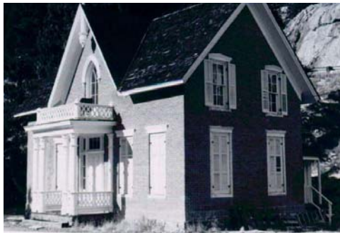
Julius G. Pohle House/ Mine Manager's House / Toll House