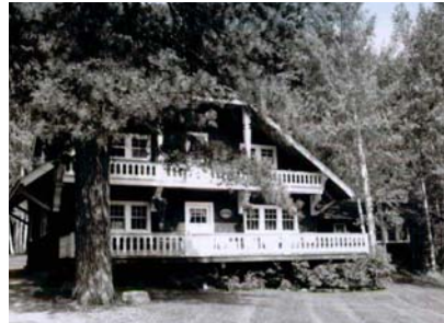
Osgood Gamekeeper's Lodge