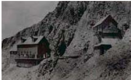
Old Hundred Mine Boarding House and Tramhouse

The boarding house and the adjacent tramhouse reflect important engineering aspects of high altitude hard rock mining. Constructed in 1904, two-thousand feet up a mountain face, these buildings illustrate the resourcefulness, perseverance and technology needed to mine the rugged San Juans. Miners in the San Juans were noted for the engineering innovation of aerial tramways built above timberline to access the more valuable ore deposits.