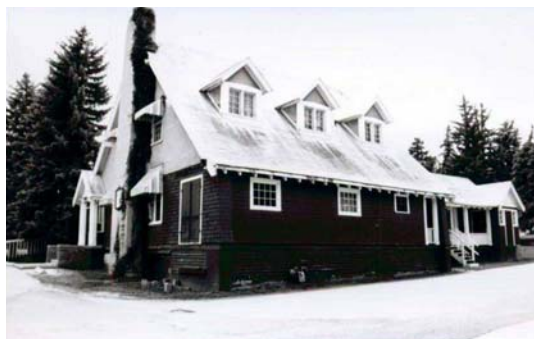
Louviers Village Club in Louviers

The community, begun by the Du Pont Company in 1906, and occupied starting in 1908, provided employee housing and support facilities for the adjacent Louviers Works dynamite plant. Du Pont carefully planned, built, and managed the village. In addition to housing for workers and management, the community included a school, church, hotel, parks and a ball field, and a large community club. The community remained under Du Pont ownership until 1962, when the company sold both the village and the dynamite plant.