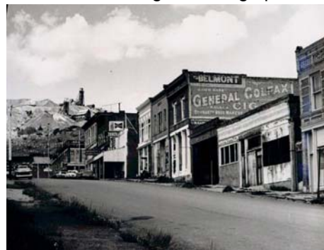
Victor Downtown Historic District

The district contains many relatively unaltered commercial, public, fraternal and religious buildings of late 19 th - and early 20 th -century design. They form the commercial core of an important mining community that composed part of the Cripple Creek-Victor Mining District. The area is one of the richest in gold deposits in the state, and it played a prominent role in the development of Colorado's mining industry. Downtown Victor still reflects the great wealth and prosperity that resulted from the gold mining operations.