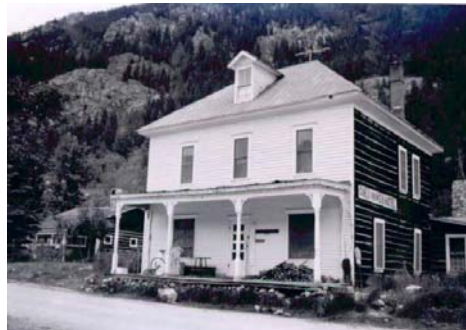
Eldora Historic District

The district includes surviving examples of the Pioneer Log, Commercial, and Rustic style building traditions associated with the mountainous portion of Boulder County. Beginning with a mining boon in 1878, development in Eldora reflected a pattern commonly found in similar communities as mining declined and local economies shifted toward tourism.