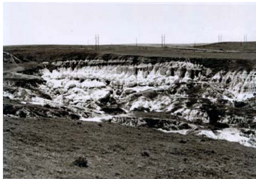
Calhan Paint Mines Archaeological District

The district provides an opportunity to understand how prehistoric peoples processed and transported clays for ceramic production. Predominantly open plains with some areas of colorful clay deposits capped by white sandstone, this archaeological landscape also has the potential to provide a better understanding of subsistence practices, specifically addressing questions of faunal procurement and processing over a span of 10,000 years, from at least 8100 BC through AD 1750.