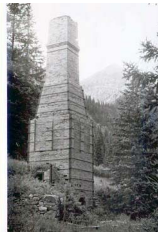
Rose Lime Kiln