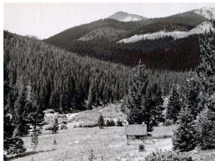
Lulu City Site