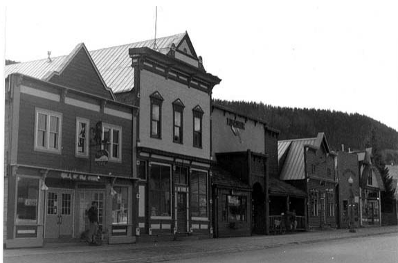
Crested Butte Historic District

Although settlers looking for precious metals were in the area as early as 1874, the town was incorporated in 1880. As the number of mining camps grew, Crested Butte thrived as a supply center. Of the 339 major structures within the district, 85 percent date from the late 19th and early 20th century. After 1885, as the gold and silver played out, the surrounding area was mined for high quality bituminous coal. Since the major coal mines shut down in 1952, Crested Butte has become a tourist center for sightseers in the summer and skiers in the winter.