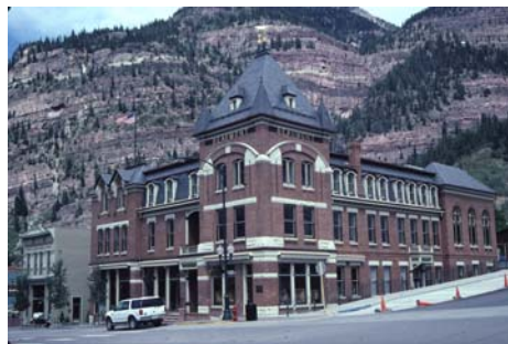
Beaumont Hotel, Ouray Historic District

Located in the San Juan Mountains, the district encompasses almost the entire historic townsite and reflects Ouray's importance as a supply center for the nearby mining regions from 1886 to 1915. The buildings within the district represent a variety of styles, with brick Italianate structures predominating in the commercial area. Primarily frame residential structures are found on the hillsides overlooking the town.