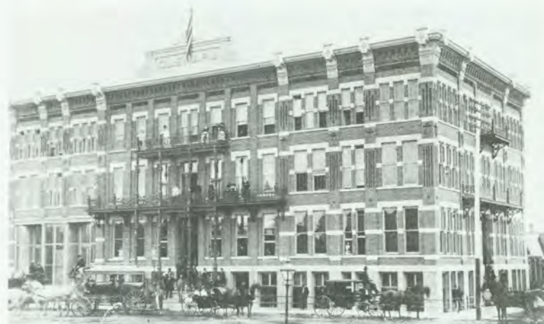
Although it served as a state office building, the bar and billiard rooms of the Glenarm Hotel remained open to all, according to an 1881 news account.

The problem of space was alleviated, at least temporarily, in late 1881, when the Society was given a room in the Glenarm Hotel, located at Fifteenth and Glenarm streets, which was then serving as the state capitol. By 1882 the Society was making plans to exhibit several cases of material, including birds, mammals, and prehistoric artifacts, in the National Mining and Industrial Exposition building, which opened on 1 August 1882.