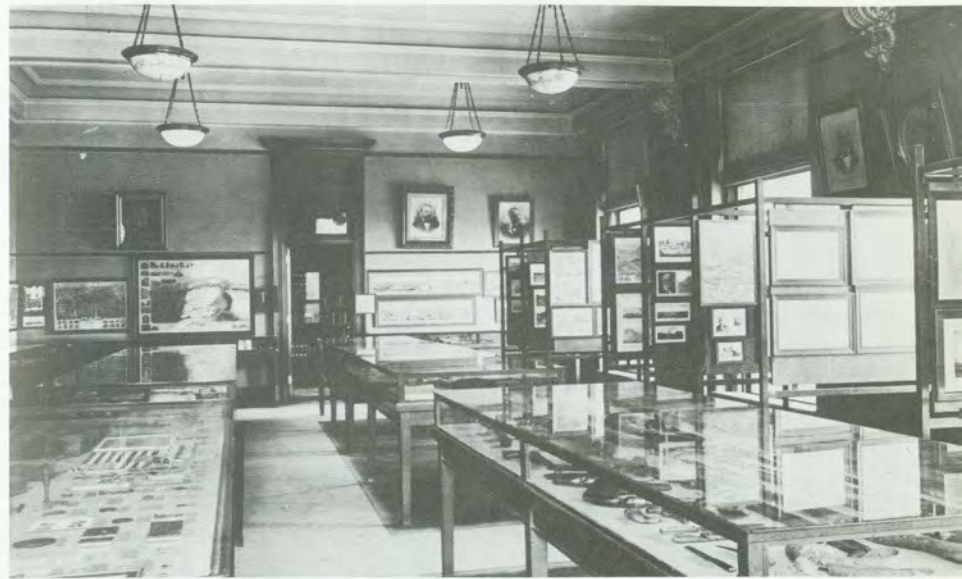
The first-floor west gallery, above, known then as the "Pioneer Relic Room." A portion of the library can be seen through the doorway. Below, the east gallery or "Cliff Dweller Room."