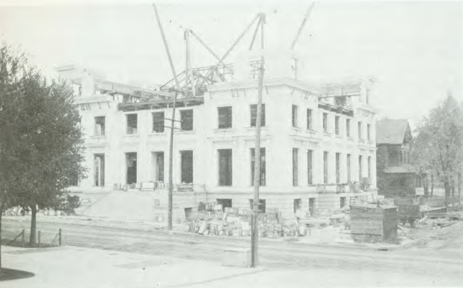
The Colorado State Museum under construction. The photograph above is dated 6 October 1912.