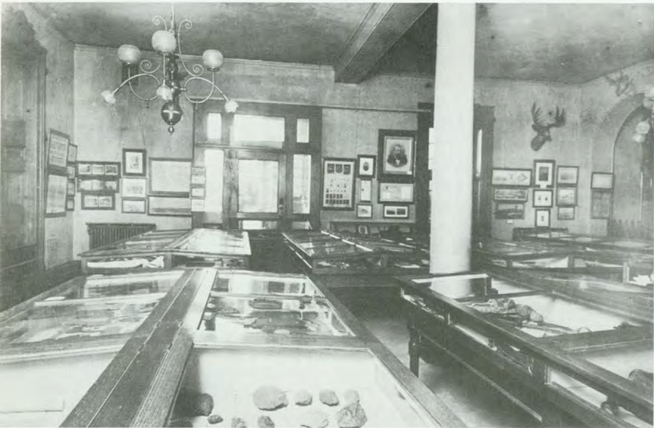
These views show the rooms of the Society in the basement of the State Capitol. They were taken by the Denver photographic firm of Balsiger and Tishler, proprietors of the I X L Studio at 1646 Glenarm Place, probably in 1911.