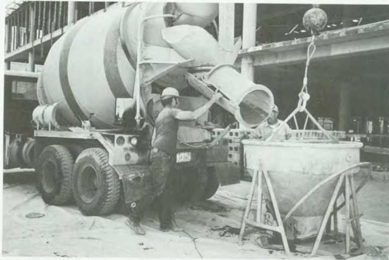
Designed by the Denver architectural firm of Rogers-Nagel-Langhart, the Heritage Center was built by the Hensel Phelps Construction Company of Greeley.