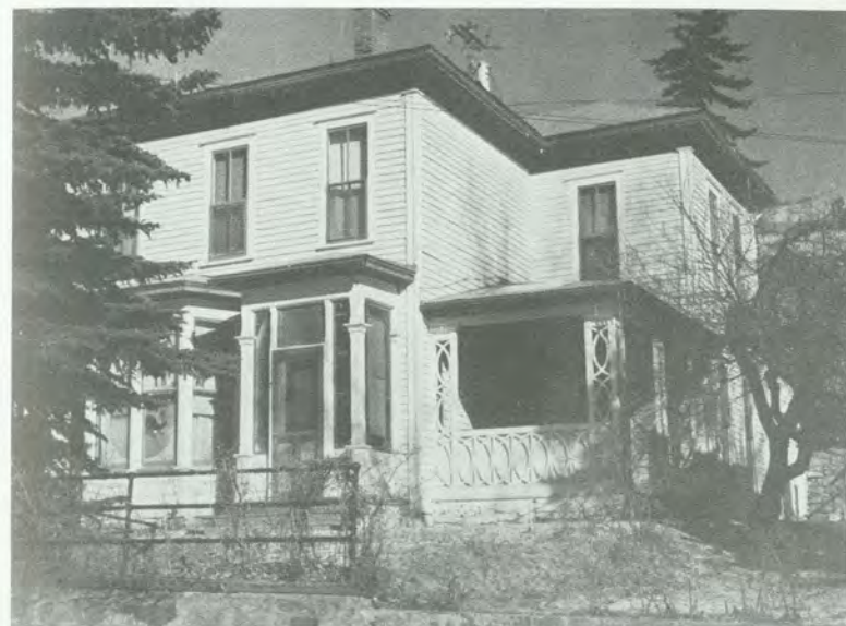
Overlooking Eureka Street, the McFarlane House is located within the Central City Historic District. It is currently being maintained and utilized by the Central City Opera House Association.