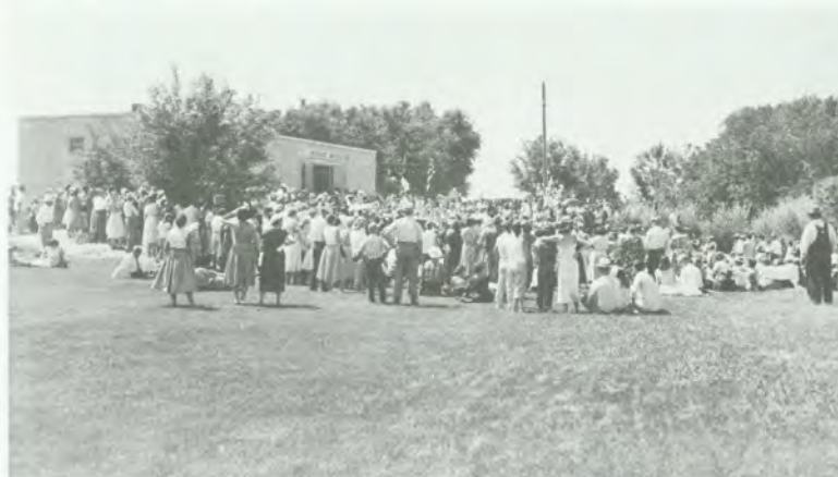
Celebrating the opening of the Ute Indian Museum on 15 July 1956.