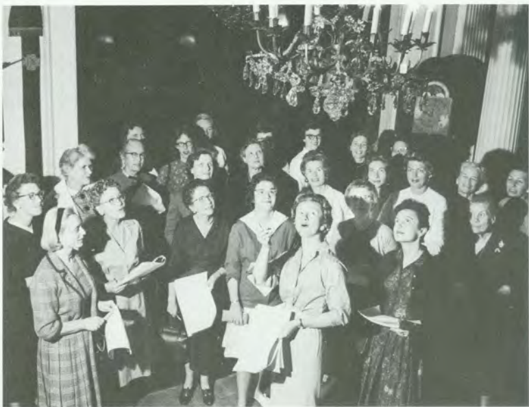
In preparation for their work as guides, Society Volunteers learn about the Governor's Mansion in June 1960.

the operations of the Society. Today the almost four hundred members of the Volunteers (both men and women) give tours to school groups, guide visitors through the Colorado Governor's Mansion, staff the museum store in the Colorado Heritage Center, provide slide-illustrated talks through the Speakers' Bureau, tape oral history interviews, and give hours of much-needed behind-the-scenes assistance to all departments.