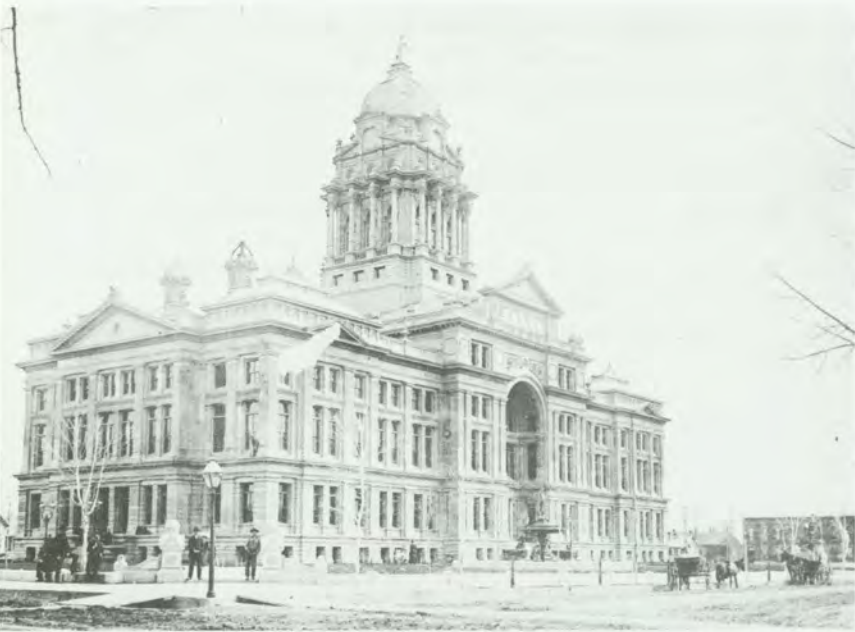
The Arapahoe County Courthouse (above), now the site of the May D&F department store. Below, the Chamber of Commerce building.