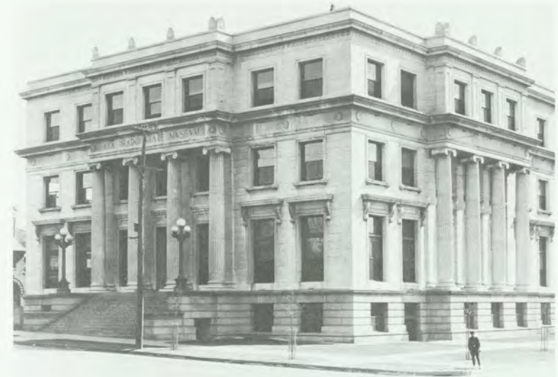
Note the size of the trees planted on the grounds of the new museum building.