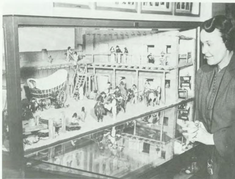
Society staff admire two completed dioramas. The view above shows the interior of Bent's Old Fort.