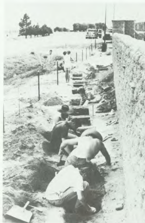
Digging at Fort Vasquez in 1968.

In addition to historic preservation, historic archaeology also was emphasized by the Society during the 1960s. Although excavations had been conducted at the site of Bent's Old Fort (then owned by the Society) in 1954, the archaeological endeavors of the Society had previously focused primarily on the prehistoric, rather than the historic, period. Beginning in 1963 with an excavation at Fort Vasquez, however, the Society took a more active role in historic archaeology. In