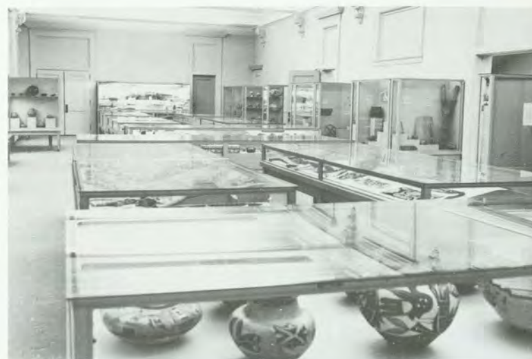
The east gallery on the main floor looking south toward the double-doored freight elevator. The view on page 21 was taken about thirty years earlier.

More far-reaching were the long-term plans to establish regional properties, which would result in the acquisition of fourteen sites and structures over the next thirty years. Such branch or regional museums would preserve important historic structures or sites, would serve as focal points for the collection and preservation of local and regional history, and would accommodate artifacts that could not be stored in the State Museum.