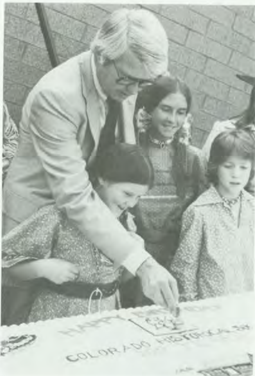
Governor Richard D. Lamm and friends cut the cake at the one-hundredth birthday party of the Society on 1 August 1979.

Society while the February lecture described the material culture collections. March focused on the photography collections, featuring the premiere of Time Exposure , a new motion picture on William Henry Jackson, and an exhibit of the contemporary albumen prints from the original Jackson glass negatives. The April program was conducted by the archaeology department, while in May historic preservation was spotlighted. During the summer the focus shifted to the regional properties, with each museum or site hosting an event for the people of the surrounding community. The centennial celebrations came to a grand conclusion with a two-day annual meeting in October. Beginning with a festive reception for keynote speaker David Lavender at the Grant-Humphreys Mansion on 12 October, the annual meeting continued the next day with a Westerners Breakfast, a series of papers, and the centennial dinner. Throughout the year a special exhibit, "One Hundred Years of Collecting," gave visitors a taste of the objects and documents amassed during the past century.