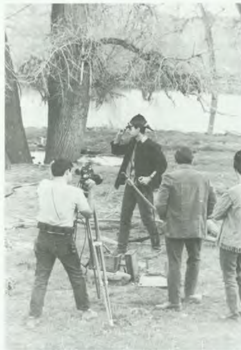
'Zebulon Pike' adjusts his hat before being filmed in a scene on location for The Indians.

In addition to disseminating information on Colorado history through its publications, the Society also produced five new motion pictures to convey the story of the state to a wider audience. A pioneer in the field, the Society was the first historical organization in the country to make such documentary films, beginning with The Story of Colorado in 1946. Produced in cooperation with Barbre Productions of Denver, The Trailblazers , a twenty-five-minute full-color motion picture on exploration, premiered in 1964. The Miners was completed in 1965, followed by Prehistoric Man (1967), The Cattlemen (1968), and The Indians (1969). Geared to all age groups, the films won several major national awards and today are distributed world-wide by Xerox Education Publications.