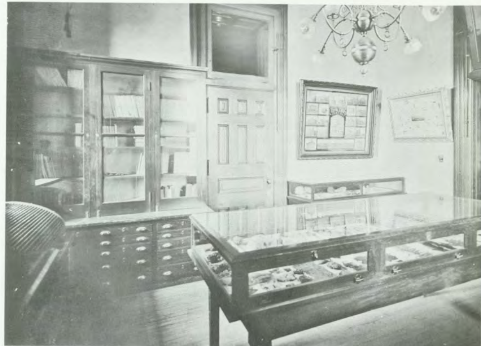
More photographs, paintings, and prehistoric artifacts. "Colorado Schools, 1876" (above, right) probably was displayed at the Philadelphia Centennial Exposition.