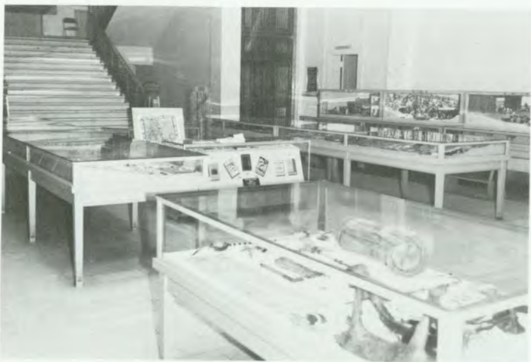
Looking toward the elevator and the library entrance (above) from the main floor lobby in 1955. Below, the east gallery looking north.