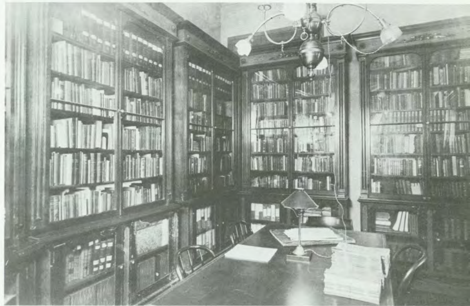
A quiet corner in the library (above). Note the reading lamp cord suspended from the overhead fixture. Below, cabinets of papers and a work table.