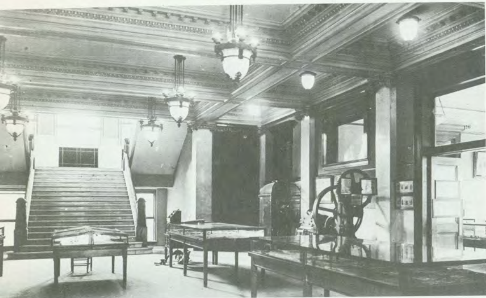
Taken prior to 1927, the view above shows the first-floor lobby of the State Museum. Below, a view looking in the opposite direction, toward the front door. Note the silver loving cup (center) presented by Denver citizens to David Moffat in 1904.