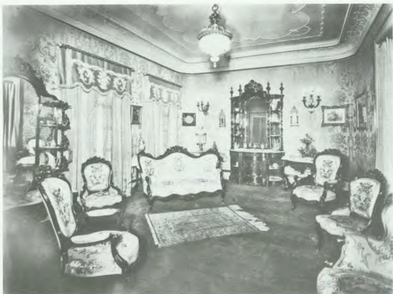
These views of the drawing room (above) and the billiard room are from an album of the family of James B. Grant, governor of Colorado from 1883 to 1885, who built the Grant-Humphreys Mansion in 1902.