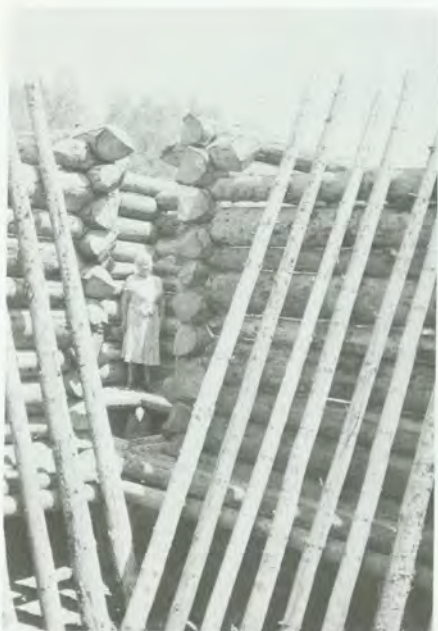
Demonstrating the height of the log walls, Mrs. Edgar C. McMechen stands in the corner of the reconstructed Pikes Stockade. Below, tangled weeds and grasses had virtually taken over Fort Garland prior to the restoration of the site.