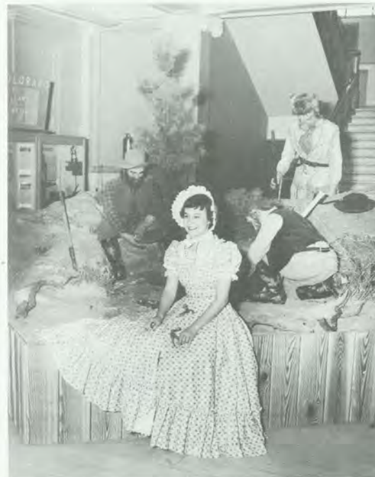
During the Rush to the Rockies in 1959, costumed guides offered "Gold Rush Gallery Tours" of the State Museum.

of the settlement of Colorado. Both the state and the city of Denver formed commissions to plan a celebration to be held in 1959, and an official emblem was designed by Trinidad artist Arthur Roy Mitchell, who later served as curator of Baca House, Bloom House, and the Pioneer Museum. During 1959 numerous pageants, parades, and other events took place; histories, brochures, and other publications, including a gold-covered special number of The Colorado Magazine , were