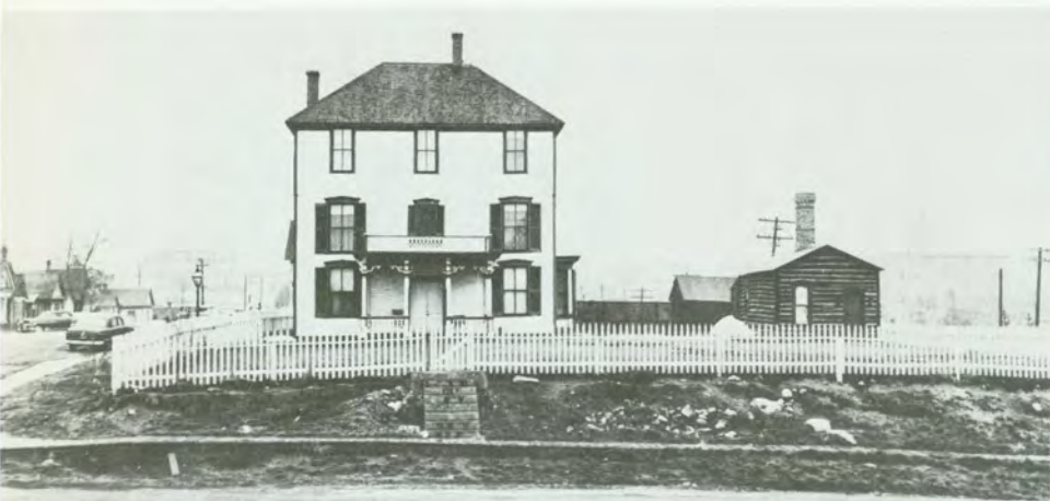
Healy House and Dexter Cabin on a blustery day in Leadville.