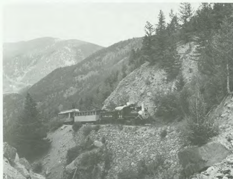
The Georgetown, Breckenridge, and Leadville Railroad chugs along the reconstructed track of the Georgetown Loop, once advertised as the "Scenic Wonder of the World."