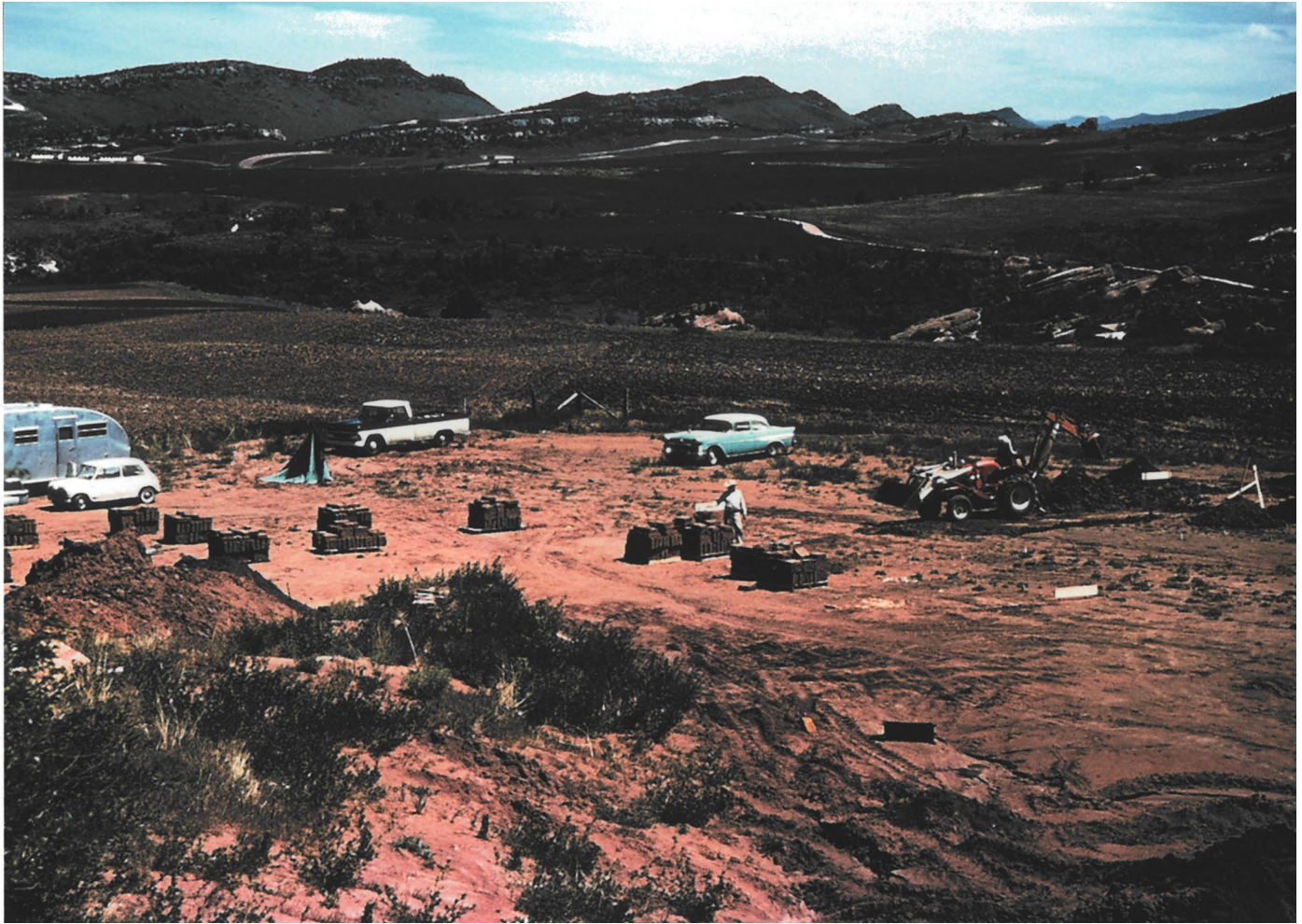
H1. Staging area for adobe fabrication. View southeast, ca. 1962-63.