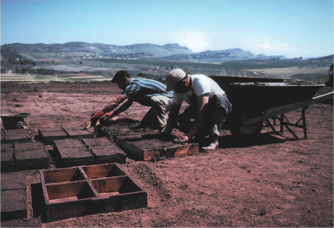
H2. Adobe brick-making. View southeast, ca. 1962-63.