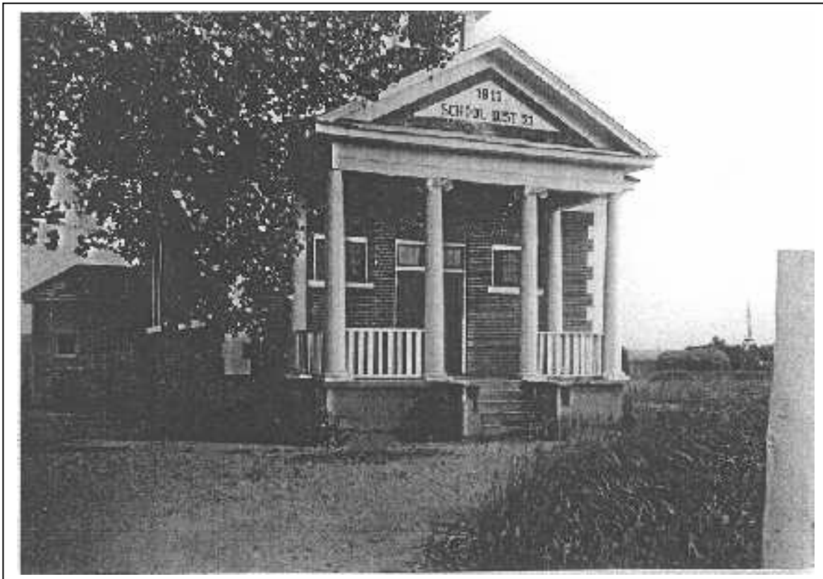
Date unknown. Notice balustrade on porch and hipped roof storage room on the left.