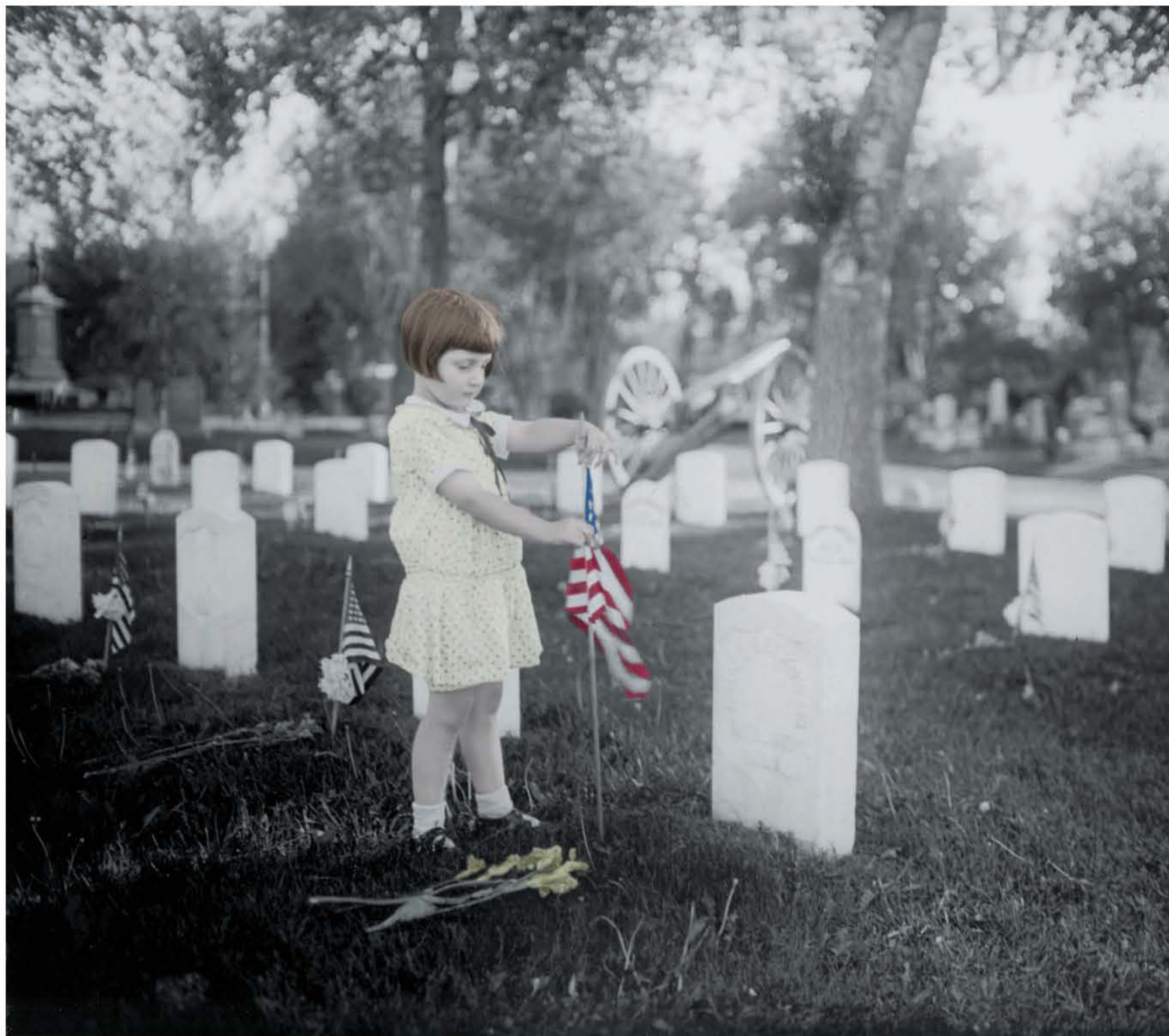
Placing flags in a Denver cemetery, Armistice Day, ca. 1918 - 1930