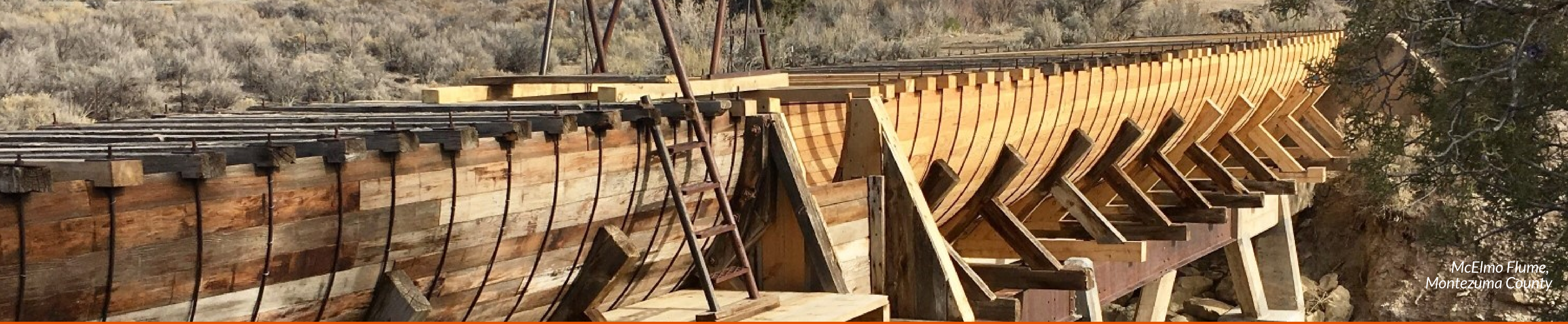
McElmo Flume, Montezuma County