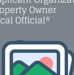
Photographs of the site and/or collection.