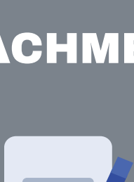
Signature page signed by: • Applicant Organization • Property Owner • Local Official*