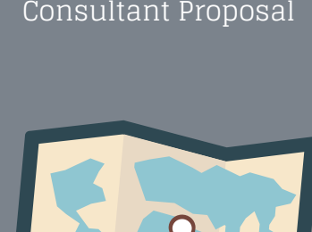
Map of the site.