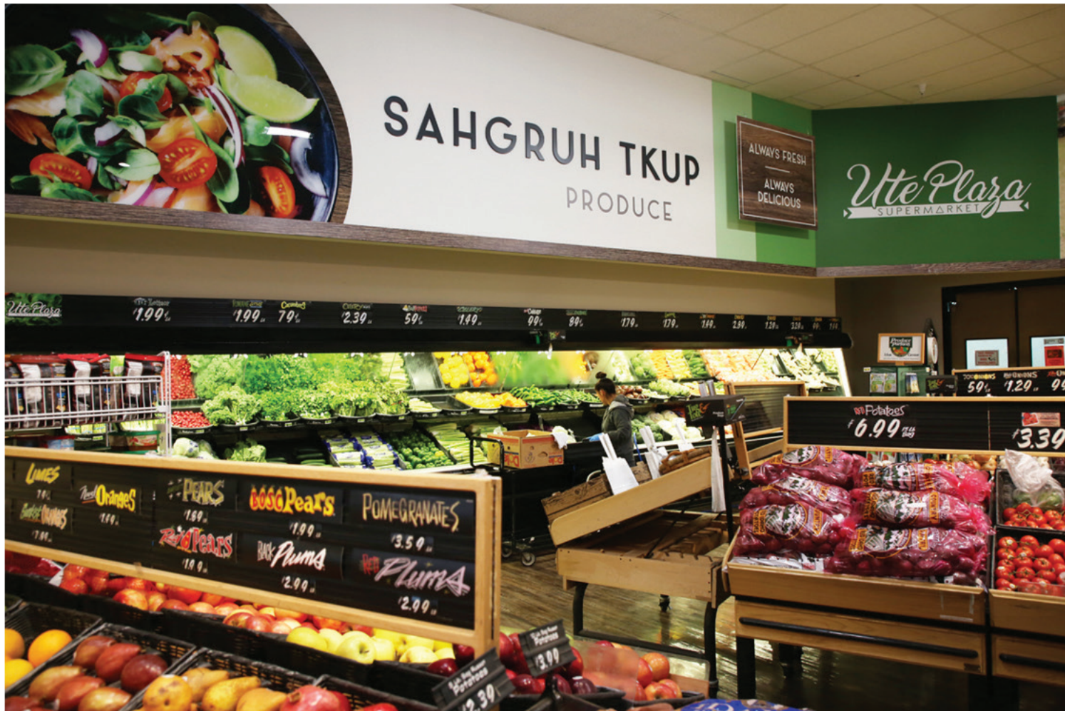
Ute atravesando un supermercado, Fort Duchesne Utah.