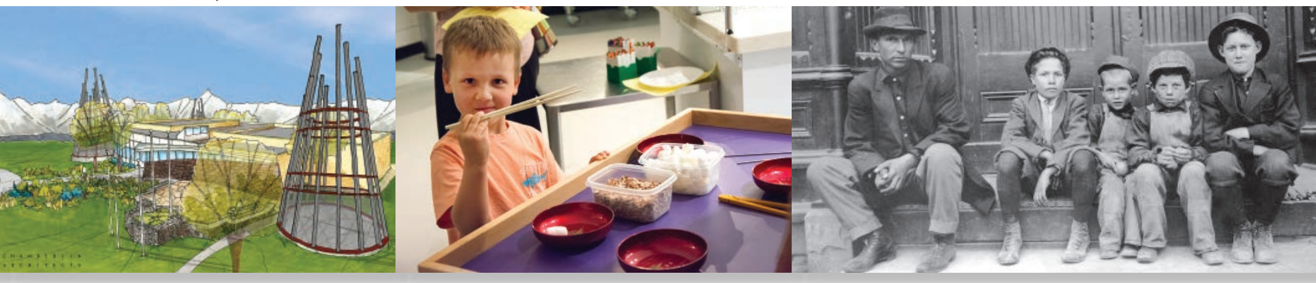
The Food: Our Global Kitchen exhibit

The Ute Indian Museum expansion in Montrose