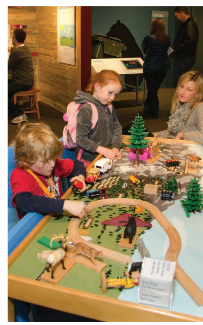
Living West teaches stewardship of Colorado's mountains.

History Colorado strives to produce the Annual Report donor and giving member recognition lists without errors or omissions. If we have made a mistake, we apologize and appreciate your calling it to our attention. Please contact us at 303/866-4477 or development@state.co.us.