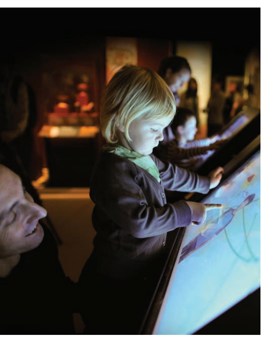
Food: Our Global Kitchen brought an exploration of the world's food to the History Colorado Center.