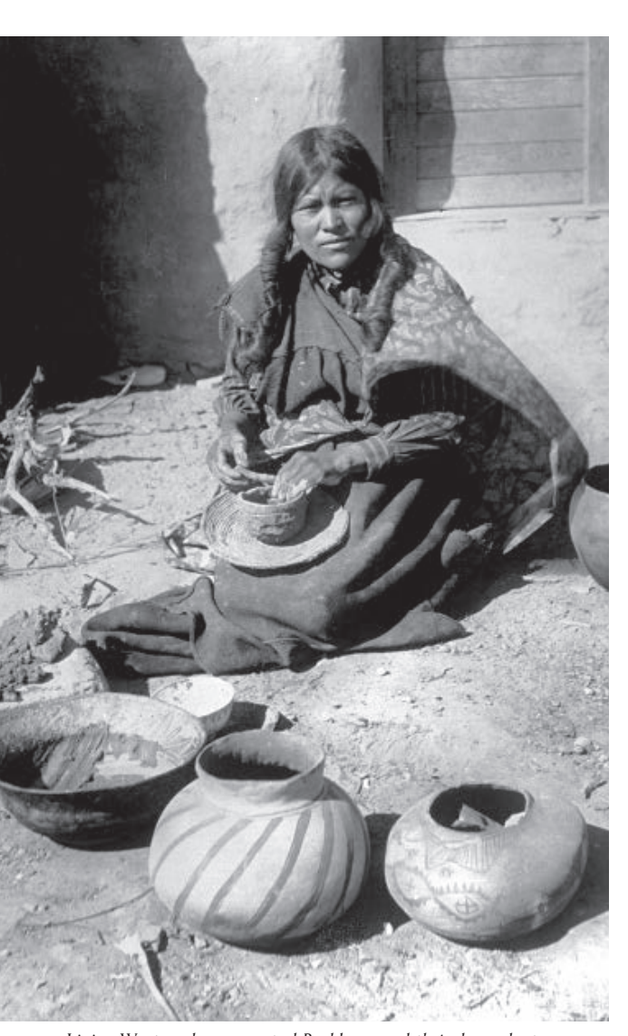
Living West explores ancestral Puebloans and their descendants