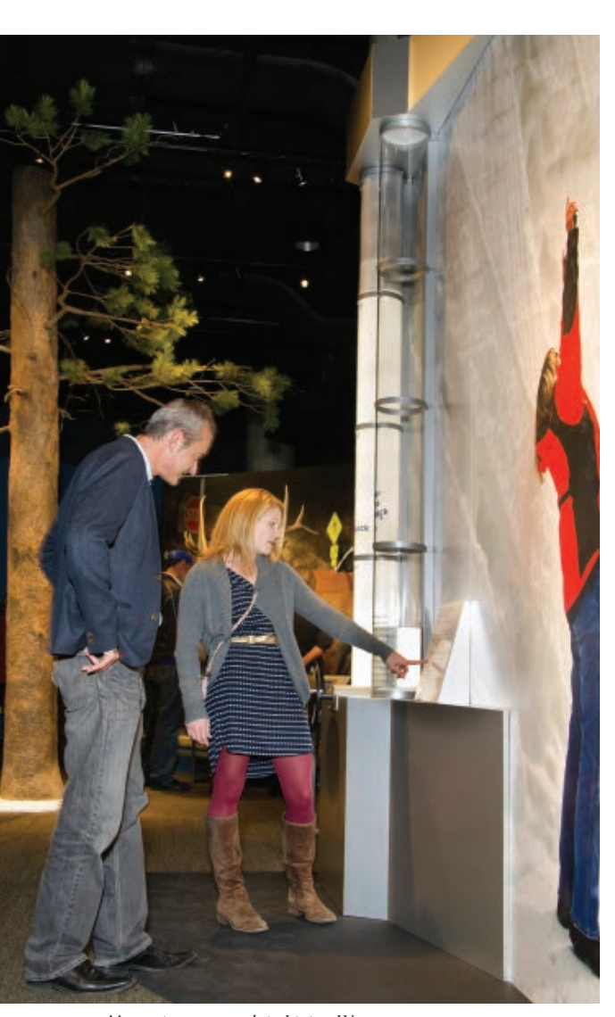
Measuring snowpack in Living West