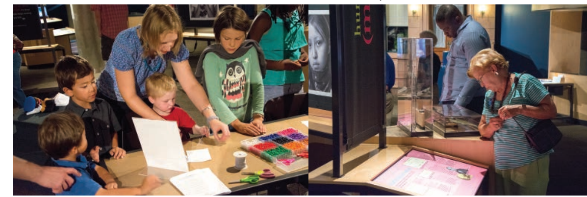
Families visit RACE: Are We So Different? at the History Colorado Center.

Like most history museums, History Colorado has done little intentional collecting of materials post-World War II. In the coming year, we'll begin building a collection that will help our successors understand the profound changes contemporary Colorado has undergone. These new oral histories, archival materials, and artifacts will serve as the foundation for exhibits and civic engagement programs that explore our recent past and our complex present.