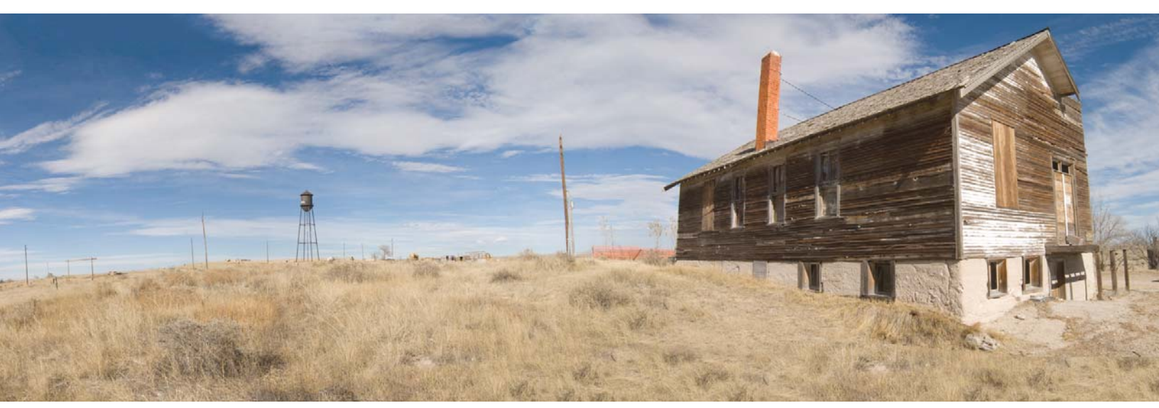
Clockwise from upper left—Downtown Salida; Animas Forks ghost town site in San Juan County; downtown Fort Collins; Keota; Picture Canyon in Comanche National Grasslands, southeast Colorado; University of Colorado students excavating at the Lamb Spring site in Douglas County